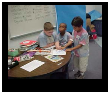
2 nd grade students working on their original Weather Report